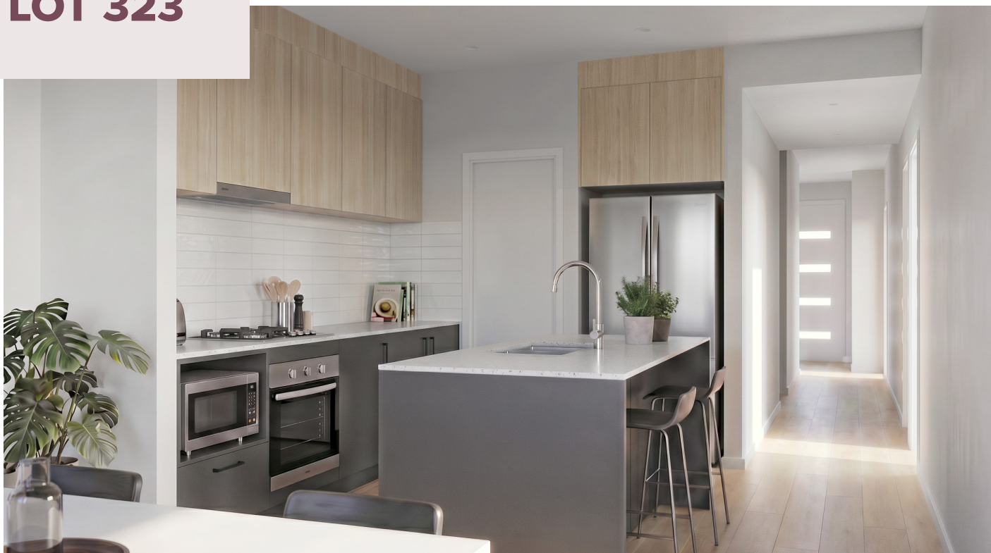
Illustration above is an artist impression that is indicative or approximate only, and can be subject to change without notice.