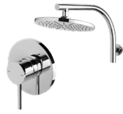
Phoenix Pina Wall Mixer & Vivid High-Rise Shower Arm