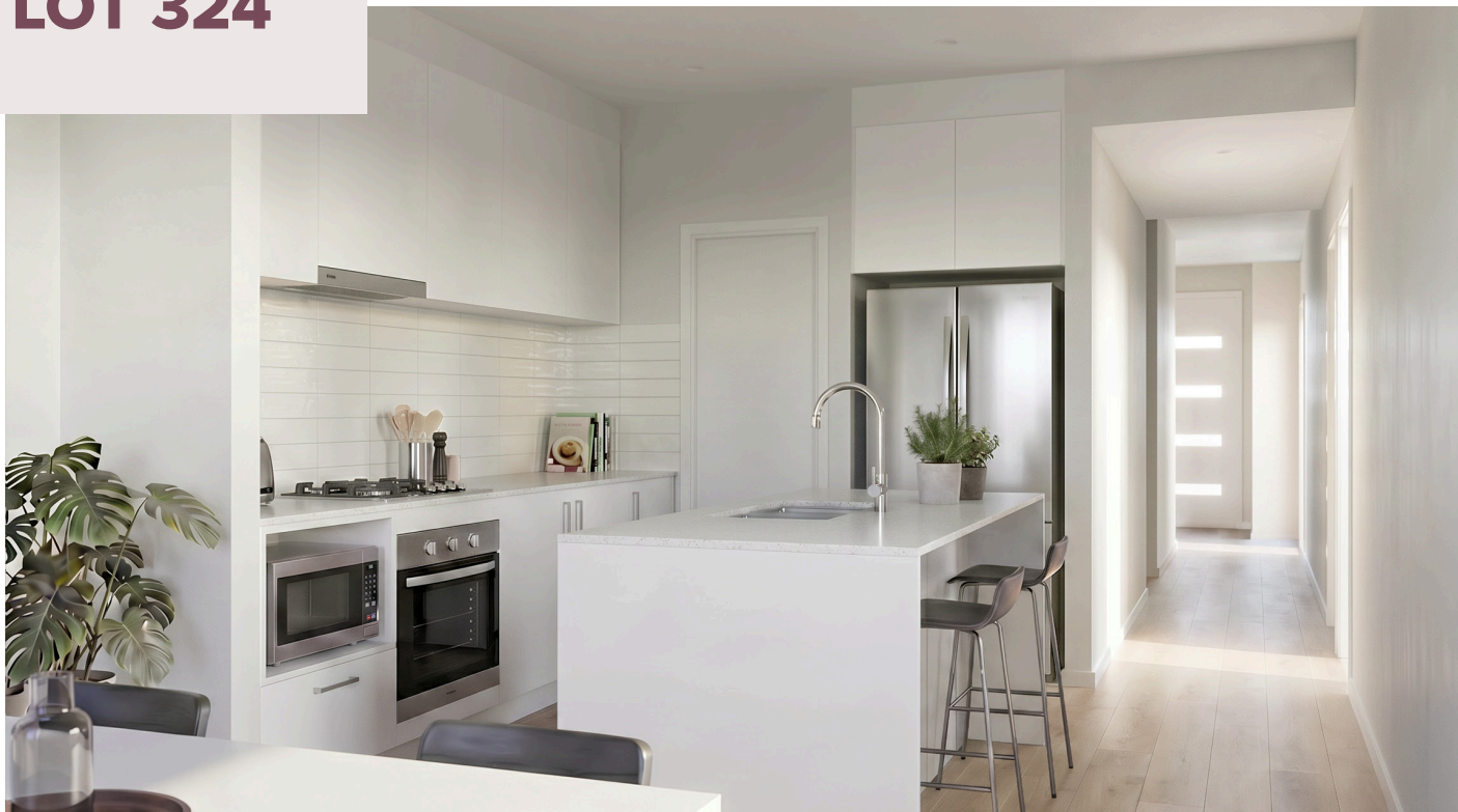
Illustration above is an artist impression that is indicative or approximate only, and can be subject to change without notice.