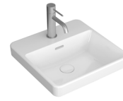
Seima Kyra 400 Square Basin