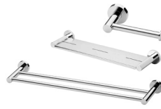
Phoenix Radii accessories incl. shower shelf, double towel rail & toilet roll holder*