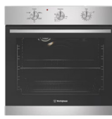
Westinghouse 600mm Electric Oven