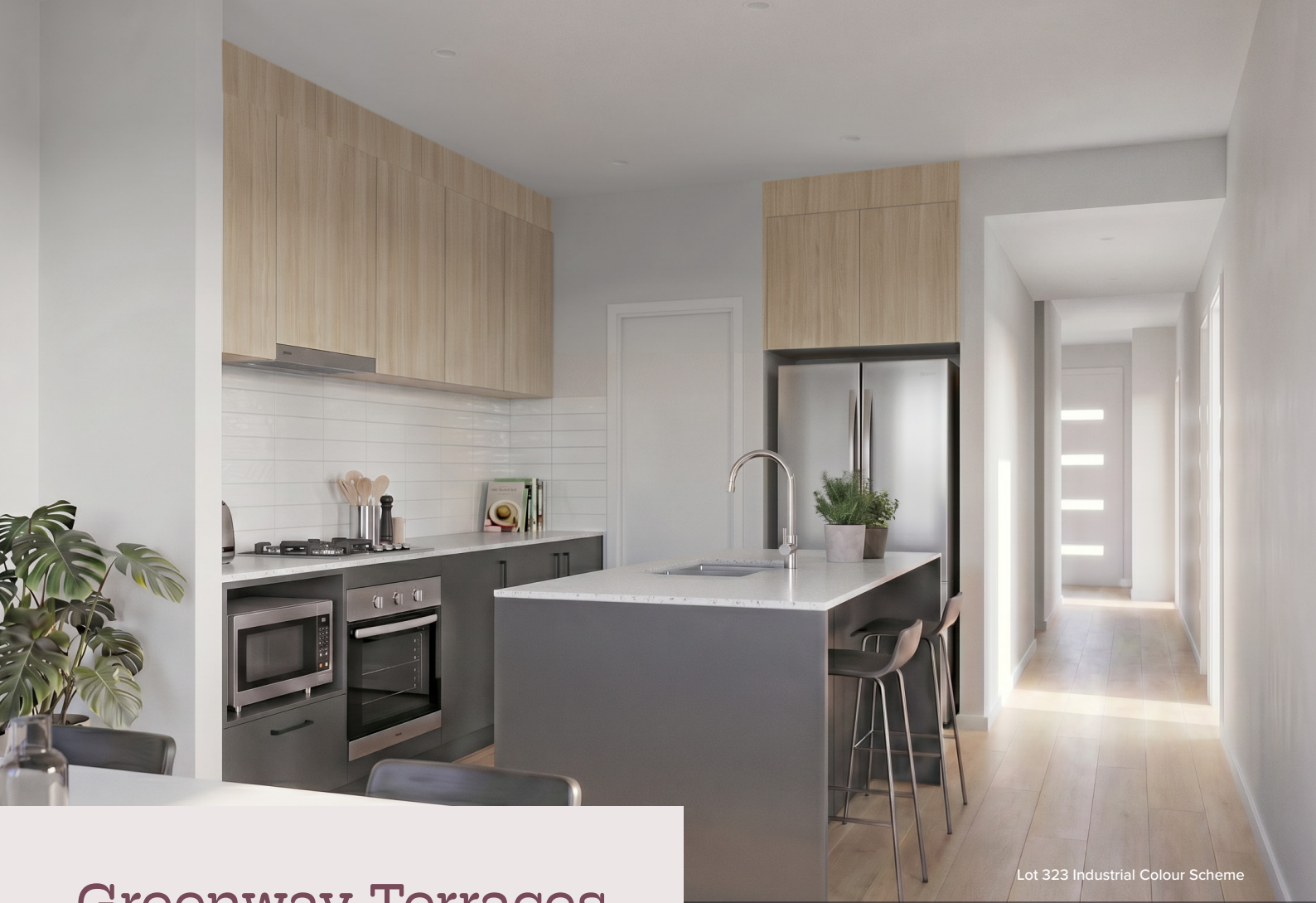
Lot 323 Industrial Colour Scheme