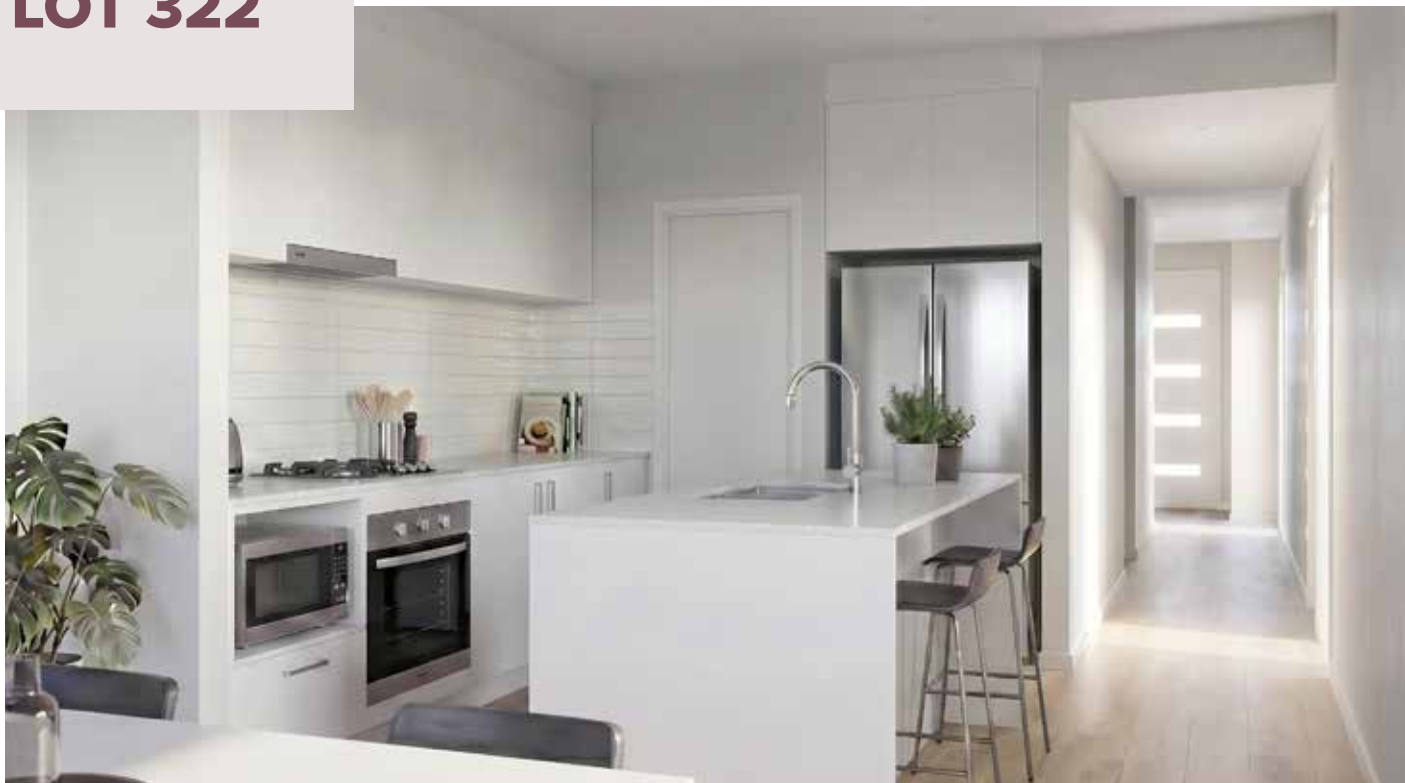
Illustration above is an artist impression that is indicative or approximate only, and can be subject to change without notice.