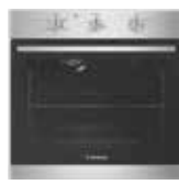
Westinghouse 600mm Electric Oven