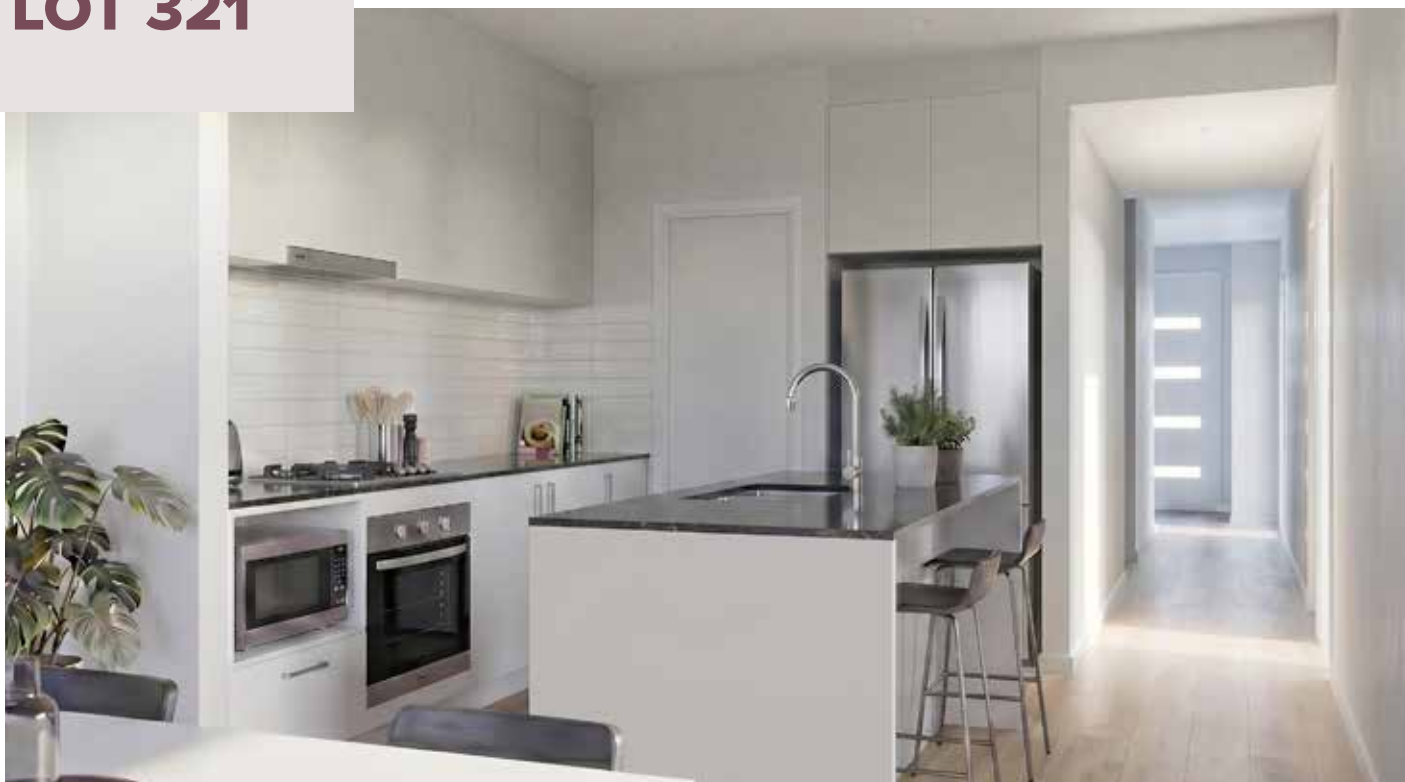
Illustration above is an artist impression that is indicative or approximate only, and can be subject to change without notice.