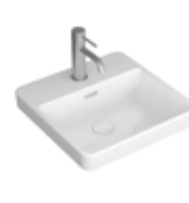
Seima Kyra 400 Square Basin