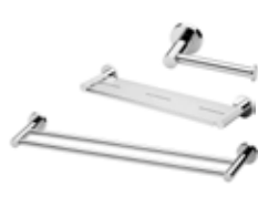
Phoenix Radii accessories incl. shower shelf, double towel rail & toilet roll holder*