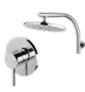
Phoenix Pina Wall Mixer & Vivid High-Rise Shower Arm