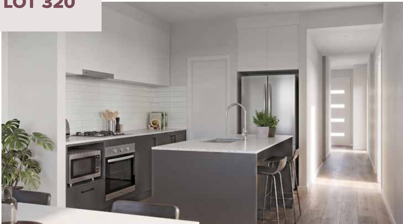
Illustration above is an artist impression that is indicative or approximate only, and can be subject to change without notice.