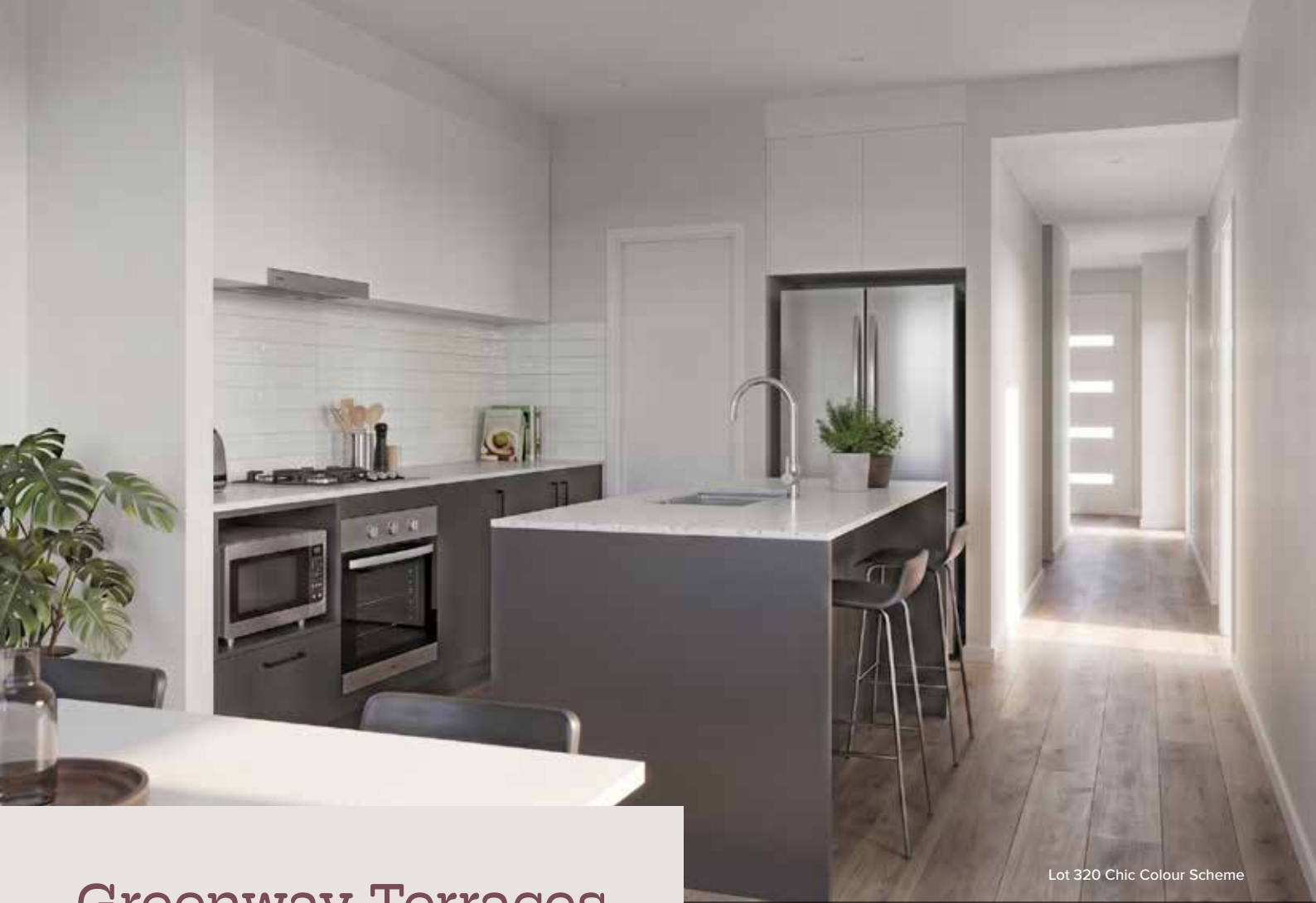
Lot 320 Chic Colour Scheme